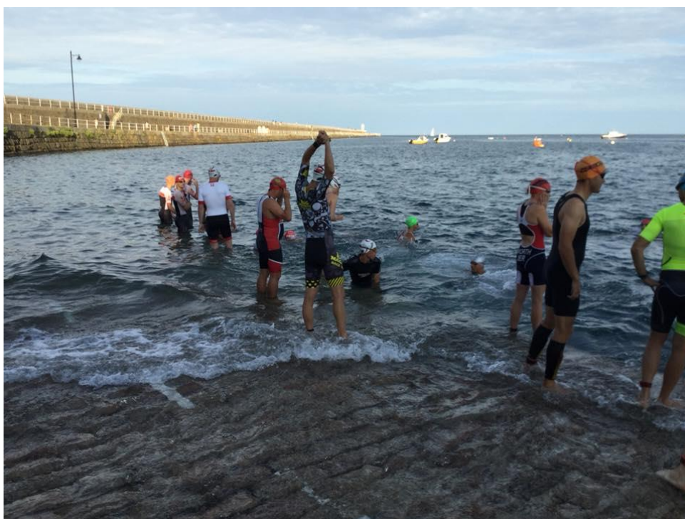
Left: Athletes prepare for the start of Race 1

Saturday evening at St Catherines saw a Jersey Triathlon Club event inspired by the international Super League Triathlon which returns next month. The event consisted of three short and fast triathlon races with the sport order mixed up each time and with only those making the qualifying standard racing in the final event. Because of the short race format certain junior age categories were also able to race head to head against senior athletes in an event well suited to those with youth on their side.