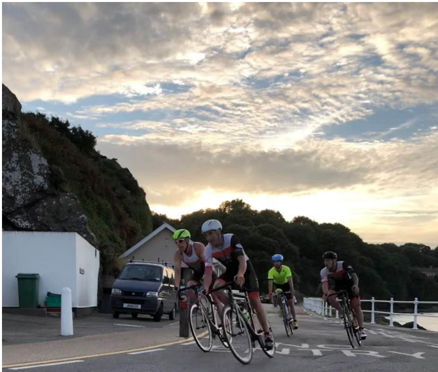
Left: an evening race made for an interesting background as the sun went down at St Catherine's.